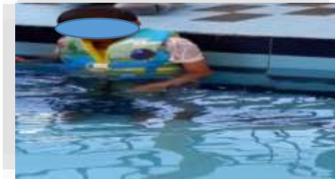
Figure 3: Aquatic standing exercises.