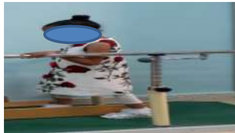
Figure 2: Balance walking exercises.

After finishing the underwater exercises, the child left the pool, took a shower (25°C), stayed in the changing room (22°C) for at least 15 minutes and took a juice before leaving (Hasanpour et al., 2020).