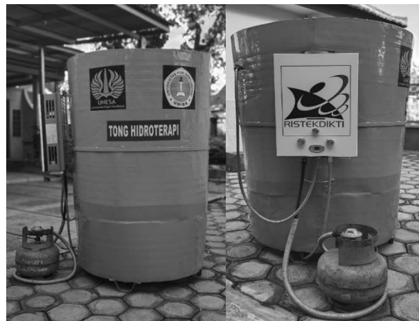
Figure 2. Photographs of the hydrotherapy device

Figure 2 shows photographs of the hydrotherapy device, providing a detailed view of its design and components.