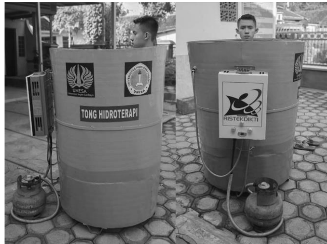
Figure 3. Device trial

Figure 3 illustrates the device in use during a trial, highlighting its application and functionality in a real-world setting.