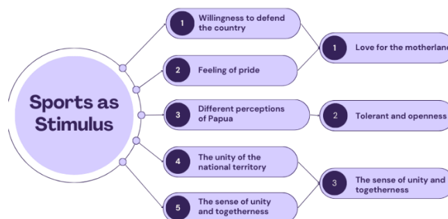
Figure 2. An overview of the results of a qualitative approach

Sport as a stimulus for a sense of nationalism can be explained from five constructs: a growing willingness to defend the country, a feeling of pride, different perceptions of Papua, the unity of the national territory, and a sense of unity and togetherness (figure 2). The research found three main aspects of the five constructs: love for the motherland, tolerance, and openness, as well as unity and togetherness.