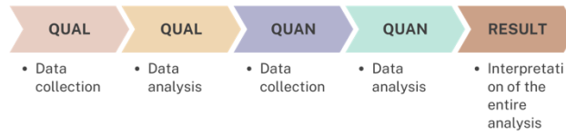
Figure 1. Sequential exploratory design

The above design is quite popular in MMR research and is often used by researchers who emphasize qualitative processes. In the scenario above, the research was first conducted using qualitative methods and continued using quantitative methods (Tashakkori & Teddlie, 2010). The strategy used by researchers in this design was to collect and analyze data using qualitative methods followed by data collection and quantitative data analysis built on the initial findings (qualitative). More quality or priority was given to qualitative data (Creswell, 2012). However, these two data types were not separate and were still related.