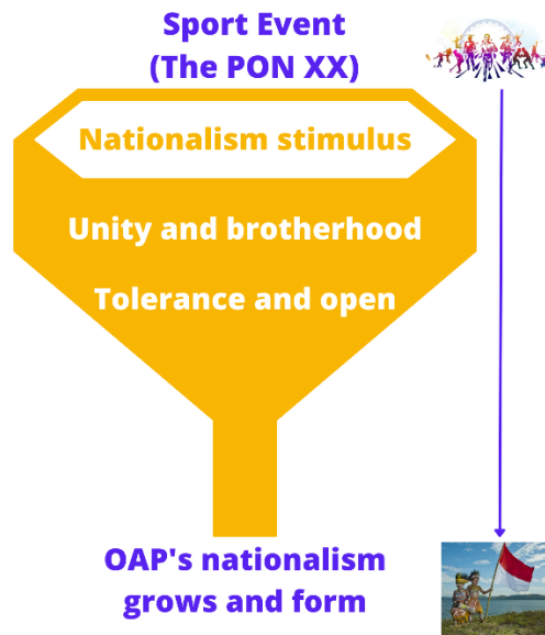
Figure 4. Scheme of growth and formation of nationalism from sporting events