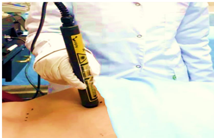
Figure 3. Model for the application of the laser on the neurogenic acupoint (BL33), which corresponds with the origin of the somatic fibers of the pudendal nerve and was located on the 3 rd posterior sacral foramen, in the sacral region.