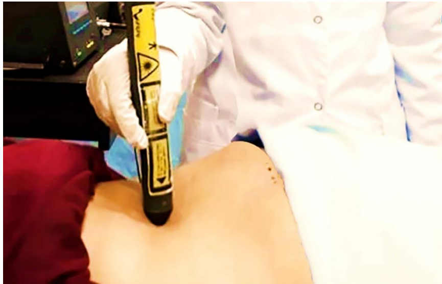
Figure 2. Model for the application of the laser on the neurogenic acupoint (BL23), which affects the micturition center and the parasympathetic innervation of the urinary system and was located at 1.5 cun external to the inferior border of the 2 nd lumbar vertebral spinous process.