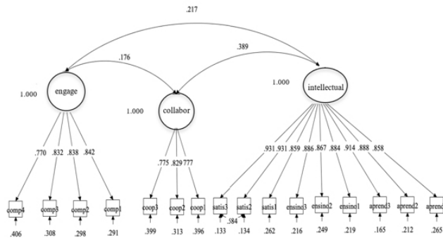
Figure 2. Experiences with graduate education: A three-latent factor approach (Model 2).

The results also suggest that student engagement, collaborative learning and intellectual growth are three distinct dimensions of a student's experience with her or his graduate program. The correlations between each of these three latent factors are well below the .7 threshold (see figure 2 and table 4). Moreover, Raykov's omega ( \omega ) (2009) indicates that each dimension of the graduate experience is appraised with a high level of reliability by their corresponding items (see last row in table 4). In sum, the final model suggests that the experiences with courses taken in graduate education programs underscore three well-defined and highly reliable latent factors, each composed of an exclusive set of indicators.