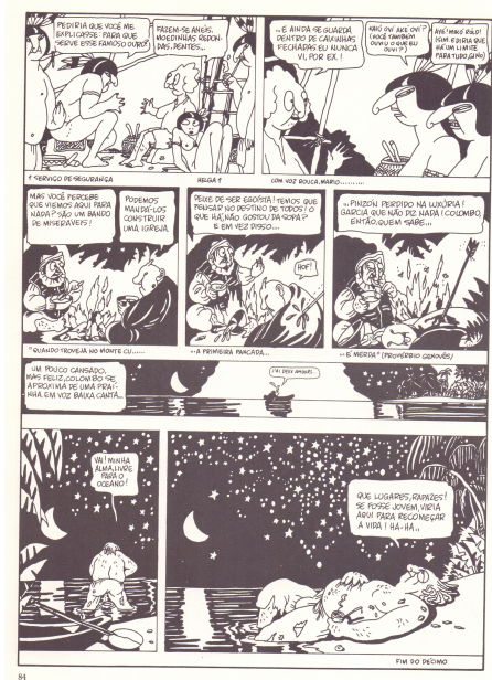
Figure 5. Version B (Altan, 1989, p. 84).

truth that young students observed in the two confronted historical comic books. The question to be addressed is: “Do you notice any difference between versions A and B? Which one (s)?”.