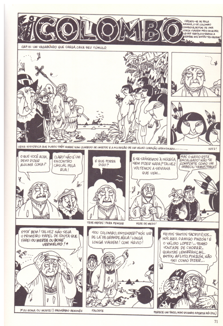
Figure 4. Version B (Altan, 1989, p. 71).

The second graphic historical narrative presented in the research instrument, the version B, called Colombo (Altan, 1989), was written and drawn by the Italian cartoonist Francesco Tullio Altan, and it is a comic book that seeks the reconstruction of historical knowledge by means of a counter-narrative orientated by an iconoclastic and critical-genetic historical consciousness about conflicts between Indigenous and Europeans in the time of the conquest of America conquest.