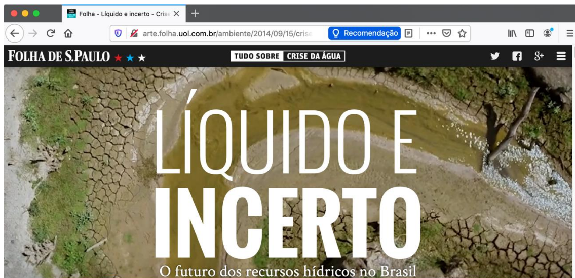
Figure 2 – Longform used in Model 1 educational material 5 .

The items have followed the characteristics highlighted by Salaverría (2014), whom observed him the importance of using different resources to would not disperse the reader, to enrich the reading, to avoid being redundant, to hierarchize the information and, finally, to adapt information and multimedia elements so that the media's support throughout students would access the content is respected. This way has used a neutral white background, contrasting fonts, rotating images, and plenty of empty spaces, which helped avoid the content from its to become too heavy or confusing.