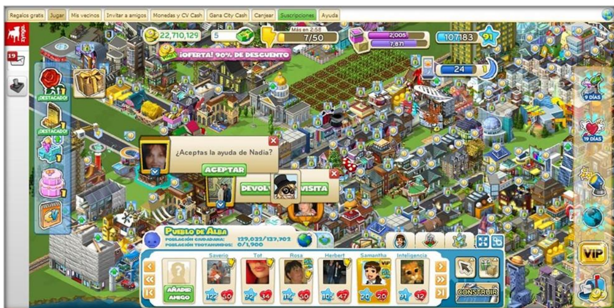
Figure 1. CityVille graphical interface

The design of CityVille is simple; it has a graphical interface with dropdown menus and intuitive icons appealing to well-known metaphors that contribute to give verisimilitude to the game scenario, making navigation and interaction easier within the ludic environment, in accordance with the usability and playability criteria defined by Desurvire and Wiberg (2009). Its graphical interface provides players with different options by means of windows and intuitive icons which identify the data corresponding to their city along with the level reached through 'XP' collection (Figure 1 shows the city of a level-91 player). A display shows the energy, coins and products that the player has, as well as the availability of CityCash or game money and, finally, the resources accumulated to improve the city, and also to extend its population and surface area, together with the product stock. The game shows the rewarded tasks and makes proposals for new missions that supply additional energy, new permits to expand, coins and pay missions, generating new challenges to move up levels.