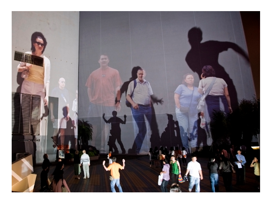
Figure 3. Rafael Lozano-Hemmer, Body Movies, Relational Architecture 6 , 2001. Hong Kong, China, 2006. Photo by: Antimodular Research. <a href="http://www.lozano-hemmer.com/showimage.php?img=hongkong">http://www.lozano-hemmer.com/showimage.php?img=hongkong</a> 2006&proj=Body%20Movies&id=7