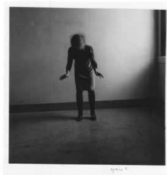
↑ Untitled , Providence, Rhode Island, 1976

Woodman constantly, almost obsessively, throughout her various works goes back to the acephalic motive, nonetheless, some elements are new; sometimes, instead of beheading the picture's subject by the frame, she decides to obscure or blur the face or the whole head. Returning to the controversies around autobiographical aspects of her works and my initial doubts about whether there is any possibility to take either of the stances, that is, either inevitably auto-biographical or completely anti-biographical and formal, I would like to conclude by saying that for me her exploitation of the Acephala figure serves as a tool to talk about herself. However, to be clear, this interpretation does not want to read her work in relation to her eventual suicide. Woodman uses the figure of the Acephala in a similar way as Bataille, Masson or Cixous did - as a figure of transgressive and hysterical liberation from the confinement of form. Acephala personifies the act of revolt, the brake away from the representation's prison towards the free border-spaces in which it is possible to express oneself. Expression and representation are dissimilar, whereas expression is a rebellious, performative act, representation is merely an act of putting the form into a standstill.