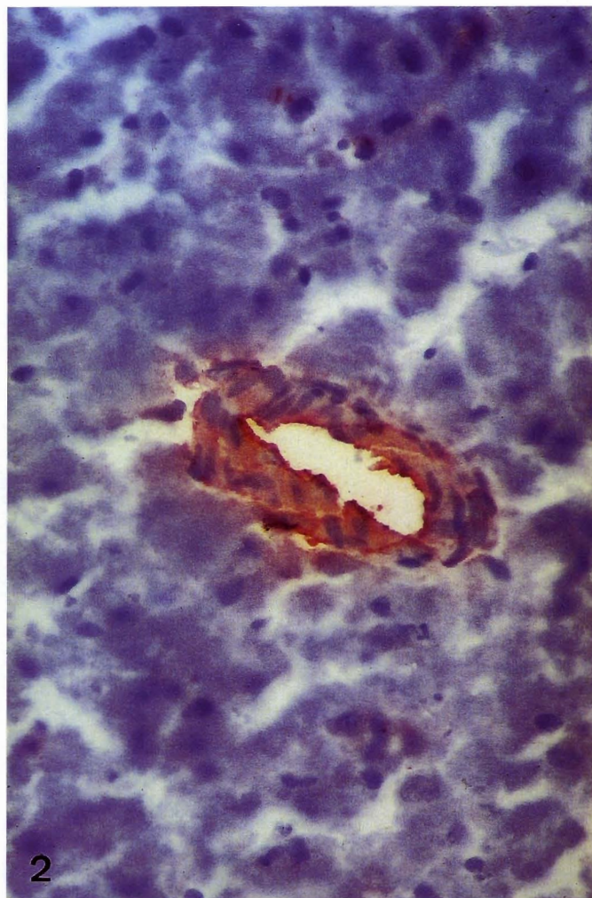
Fig. 2. Homogenous cytoplasmic VIP labeling of the vascular endothelium (diencephalon). x 250