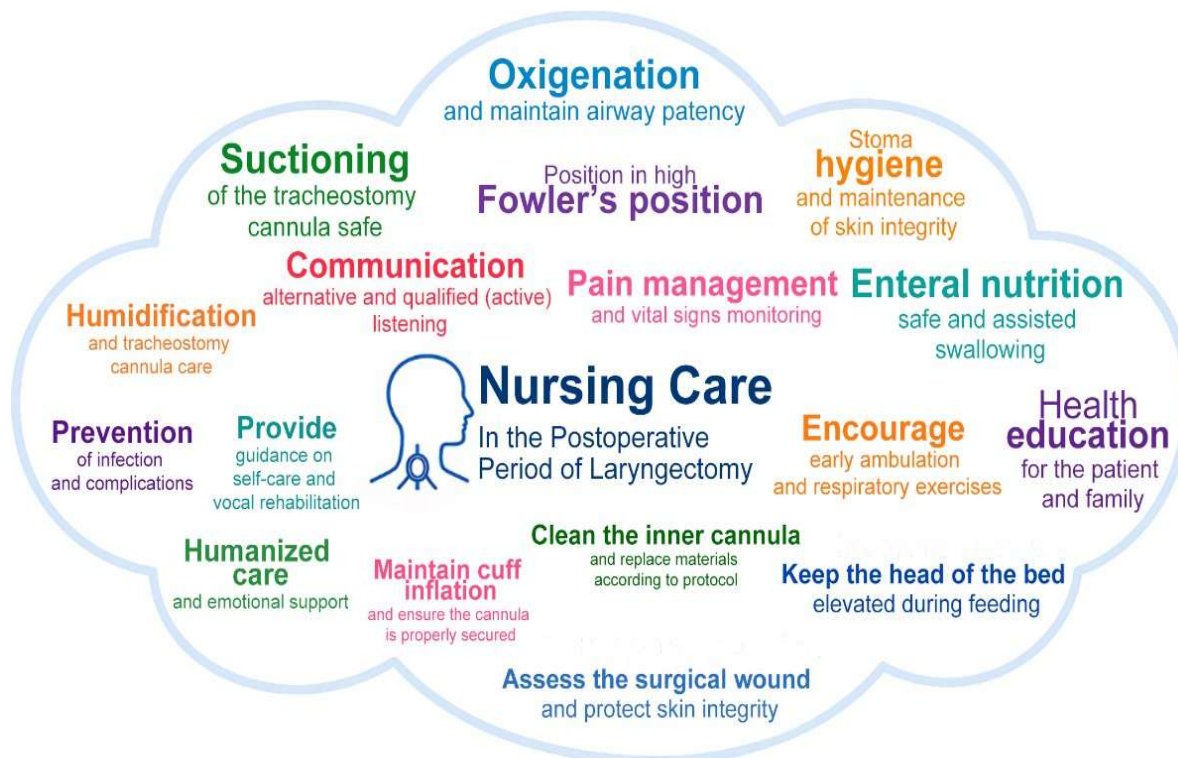
Figure 3: Graphical representation of the most frequent Nursing Care provided to the laryngectomized person, in the selected studies (n=20). João Pessoa, Paraíba, Brazil, 2025.