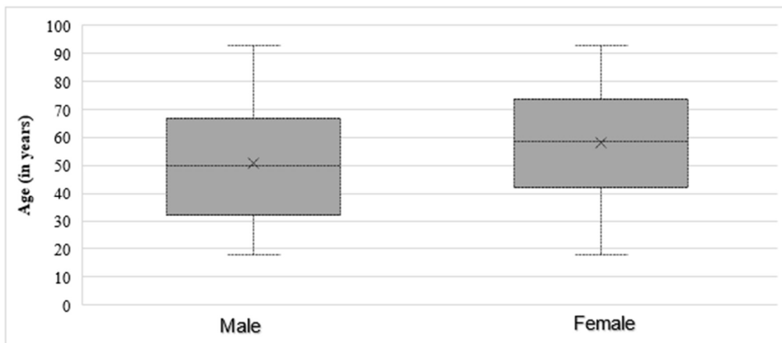
Figure 1. Boxplot graph of patients' age in intensive care unit, according to sex. Maringá, Paraná, Jan-Dec/2021.

In the comparison between the sex of the participants in this study, there was a change in age. Men had a mean age of 51 years (Md=50; SD=20), whereas women had a mean age of 58 years (Md=59; SD=19) (Figure 1). Regarding the length of hospitalization, it was noticed that the duration was close among men (Me=17; Md=11; SD=18) and women (Me=16; Md=10; SD=19) (Figure 2).