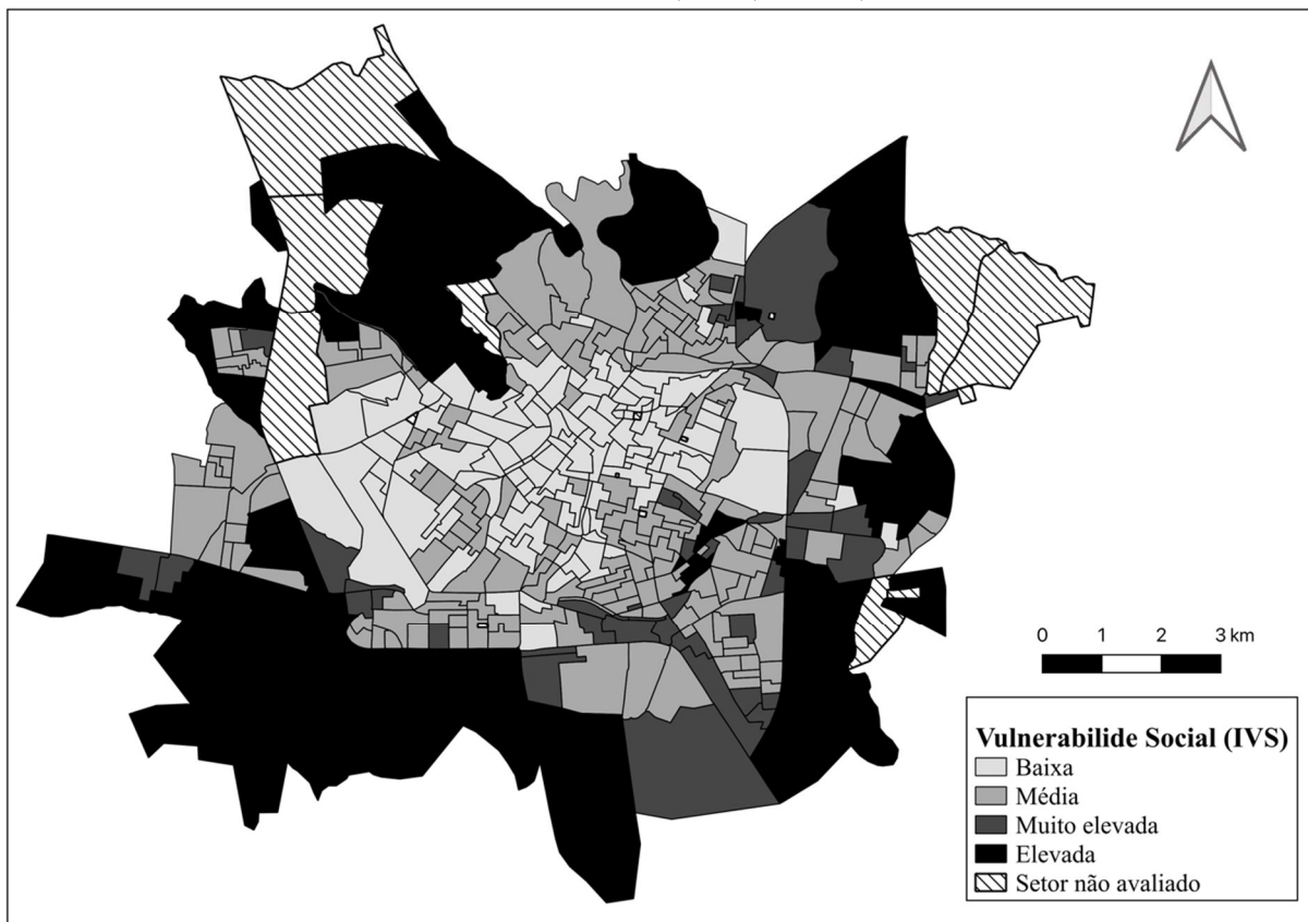
Figure 2: Spatial distribution of census tracts in Uberaba – MG, according to SVI, Uberaba, MG, Brazil, 2014.

Based on the census tract of participants' residence, it was verified that 53.8% (n=377) of the older adults lived in areas with low social vulnerability; 30.5% (n=214) low; and 15.7% (n=110) high/very high.