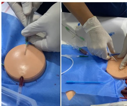
Figura 2. Simulation equipment to perform puncture practice.

The tissue models were made from platinum-based silicone rubber, within which they had a tubular structure of 6.5 mm in diameter, which ran along the structure. Each edge of the tube, or "vessel", was sealed at both ends and filled under pressure, with a system of rigid hoses that allows the passage of the guide and the advancement of the catheter, with saline solution with red dye to simulate blood. The total cost of each model was approximately 50 USD ( figure 2).