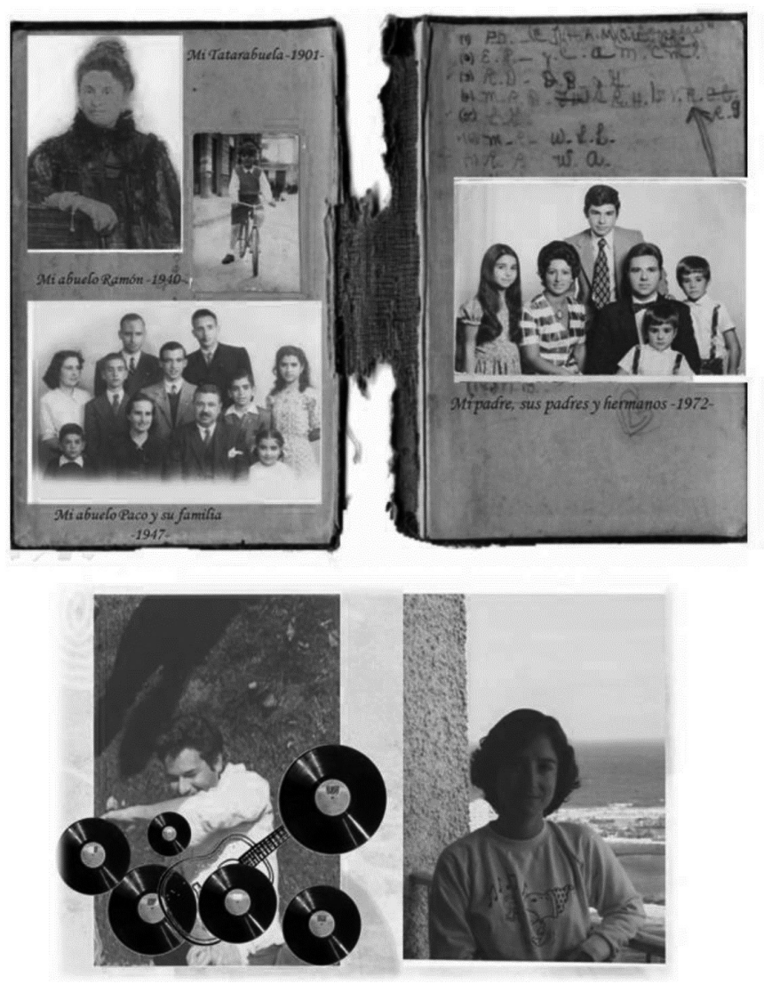
Figure 2. Selection of Images of the Micro-Tale of the Student A. C.-C.

Concerning the sounds, we suggested using recordings of their own voice or of their informers and other human sounds, natural and artificial, collected or downloaded from sound banks such as fragments of musical pieces, manipulated or not, leaving to their judgement the way of integrating them with imagery and text (as a background, the soundtrack of the tale, or alternated as a slideshow) (see Testimony 4, Figure 2 and