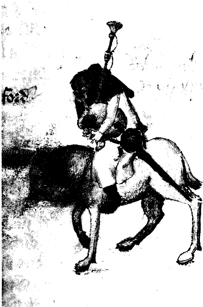
The Miller: 'A whit cote and a blew hood wered he A bagpipe wel koude he blowe and sowne' (564).