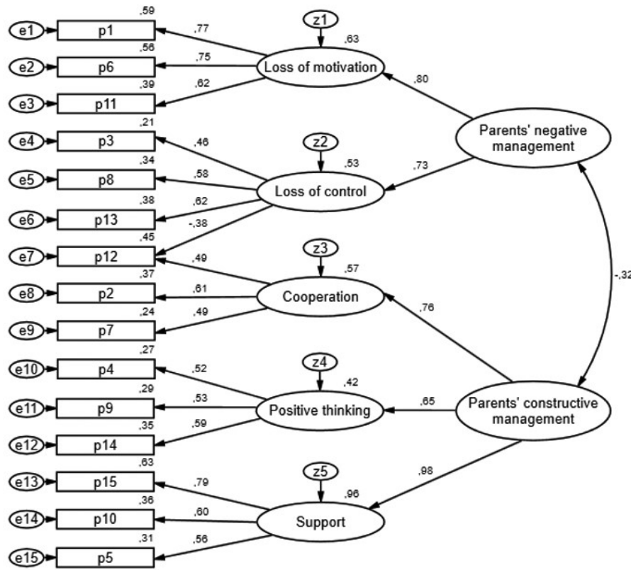
Figure 1. Parents' reactions in front of children's behavior problems. Model 2. Standardized confirmatory solution.

In the cross-validation analysis (AFC4) against the \chi^2 statistic was significant ( p < .001 ), but the \chi^2/df ratio and all adjustment indices were within the model acceptance limits ( \chi^2/df = 1.50 ; GFI = .92; IFI = .92; TLI = .91; CFI = .92; RMSEA = .035; SRMR = .066). In addition, the group comparison showed that adjustment indices did not decrease significantly if restrictions were imposed for the acceptance of the equality between samples in relation to the measurement weights ( \Delta\chi^2 = 6.16, p = .86 ), structural weights ( \Delta\chi^2 = 9.55, p = .79 ), structural covariances ( \Delta\chi^2 = 11.55, p = .83 ) and structural residuals ( \Delta\chi^2 = 15.55, p = .74 ). These results suggest there are no differences in model fit or both samples.