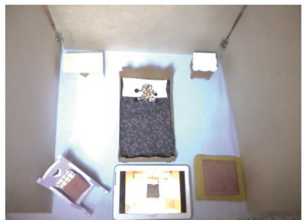
Figure 1. Photograph of the hiding room and the Tablet.

where she or he had seen an object being hidden by the experimenter: Indicate task . The tasks consisted of four subtests, in each the toy was hidden in four of five different possible locations (bed, cushions, box, armchair and bedside table). The children were randomly assigned to two groups according to the order of presentation of the tasks. Half of the children solved first Indicate and then Search (Group 1: 23-26 months; M = 24.58 months, SD = 0.90, 4 girls and 8 boys) and the other half the other way round, Search-Indicate (Group 2: 23-26 months, M = 24.58 months, SD = 1.08; 8 girls and 4 boys). The order of presentation of the four hiding locations was counterbalanced, the fifth possible location served to prevent from choosing by discard.